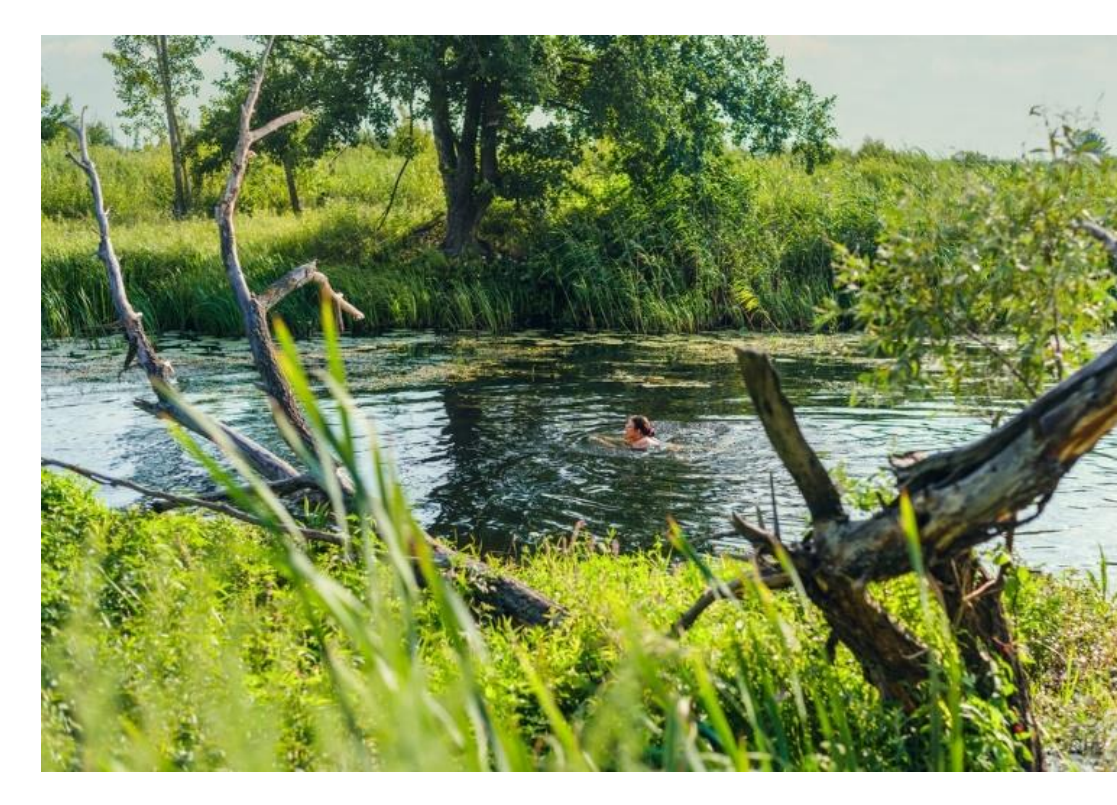
Recreational water use has driven concern over water company performance. But not all customers want bathing water quality rivers.