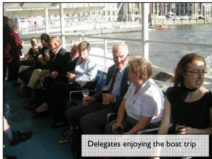
Delegates enjoying the boat trip