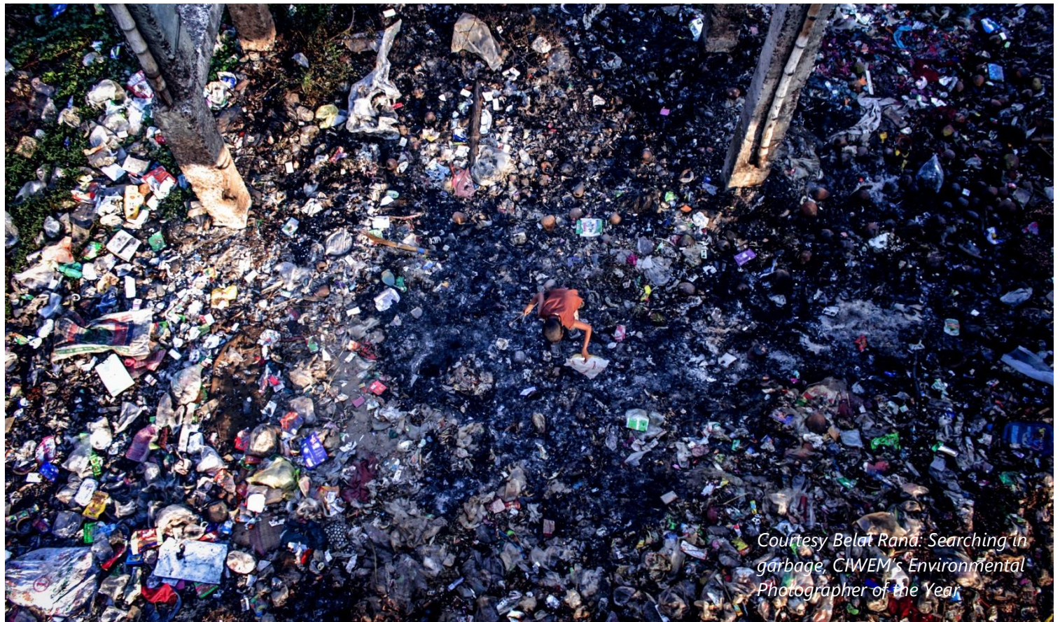
Searching in garbage, CIWEM's Environmental Photographer of the Year

Outside of the European Union the UK will need to address plastics with its own strategy. Plastics can easily form part of a circular economy with reuse or recycling if they are designed appropriately and are properly recovered and managed when they reach the end of their life. Methods should include improved product design and substitution, extended producer responsibility and deposit return schemes.