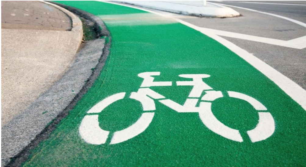
Figure 2. High friction plastics are used for junctions, cycle lanes and on roads with high traffic volumes

made. The properties of microplastics in the oceans differ substantially from those in sewage and run off as there has generally been more opportunity for the breakdown of larger plastic fragments into secondary microplastics.